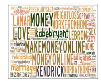
(a) Tagcloud for safe posts